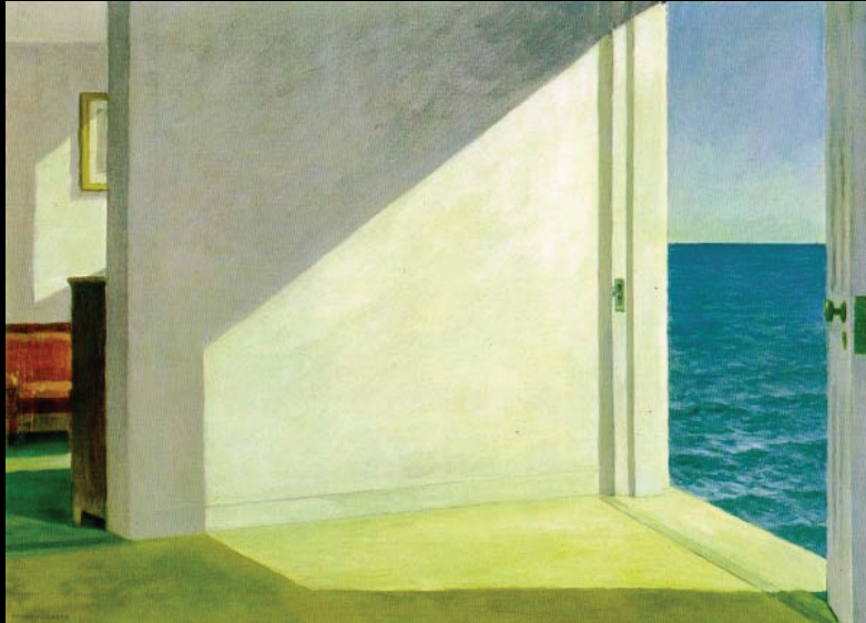
Rooms By The Sea - Edward Hopper

The protagonist stands at the door of death, giving his last poetic performance. He distances himself from his ego and the emotions and failures of his life.